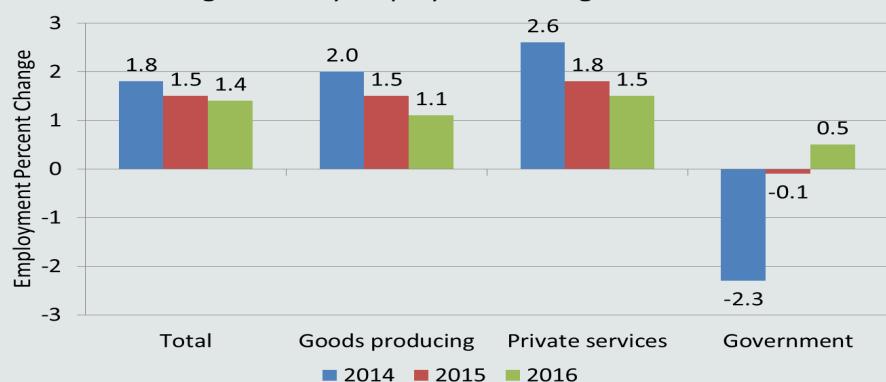
Muskegon County Employment Change and Forecast

The Upjohn Institute also revised its forecast regarding Muskegon County’s Employment Change from its original prediction of 1.4% to 1.5%. This change is based on the job growth experienced by the region over the first half of the year.